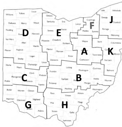
OHIO MD 13 1963-64 to 1965-66