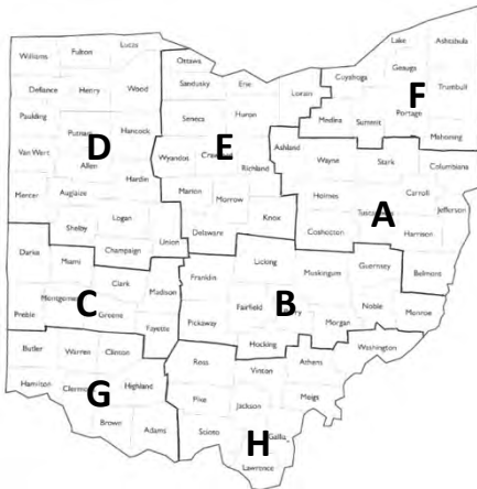
OHIO MD 13 1950-51 to 1956-57