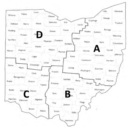
OHIO MD-13 1941-42 to 1950-51