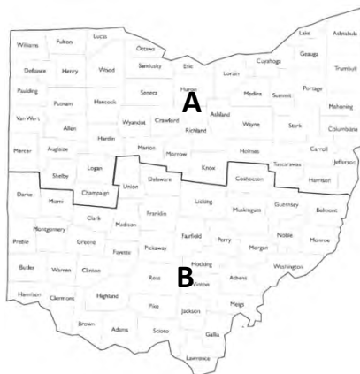
OHIO MD 13 1920-21 to 1940-41