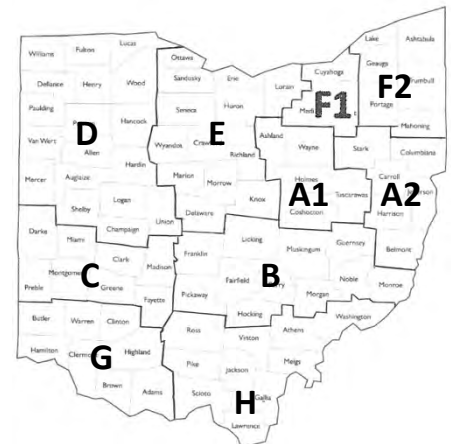
OHIO MD-13 1959-60