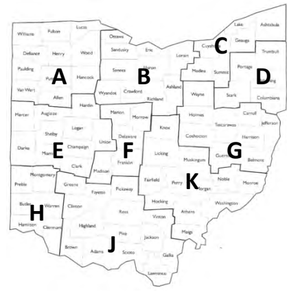
OHIO MD-13 1966-67 to 2015-16