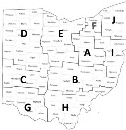
OHIO MD 13 1960-61 to 1962-63