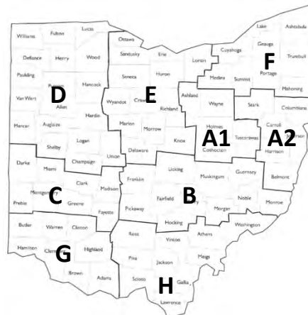
OHIO MD 13 1957-58 to 1958-59