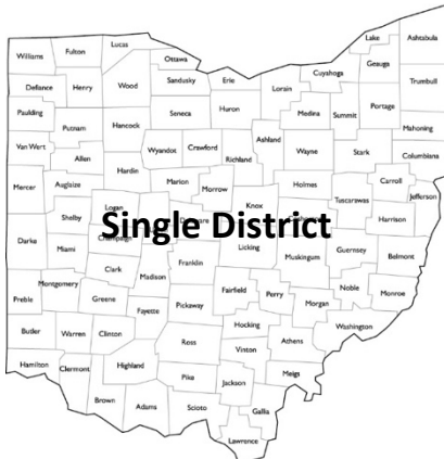
OHIO DISTRICT 13 1920-21 to 1931-32